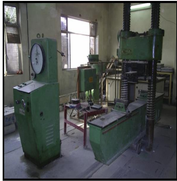
Figure (2): MFL Testing Machine