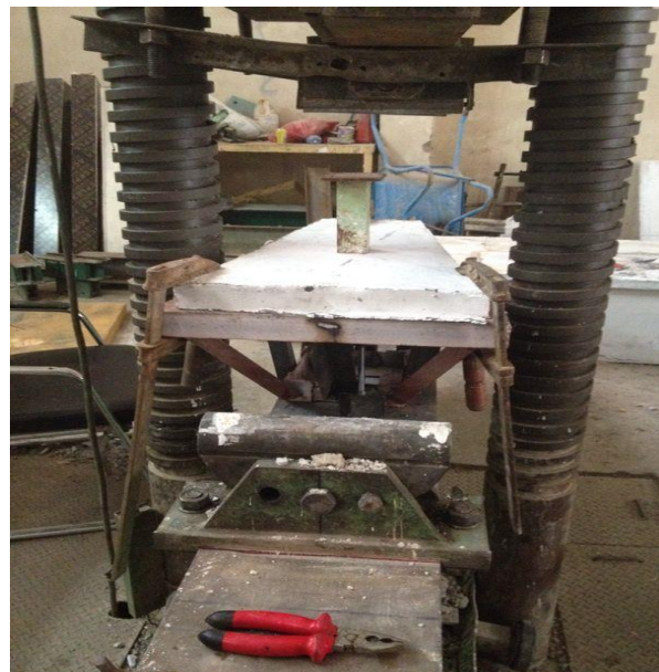
Figure (3): Shows the Loading Test System