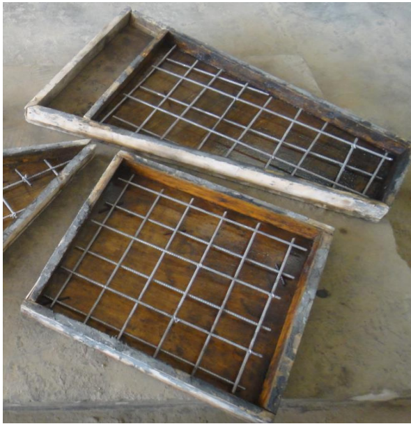
Figure (1): The Square and Trapezoidal Specimens