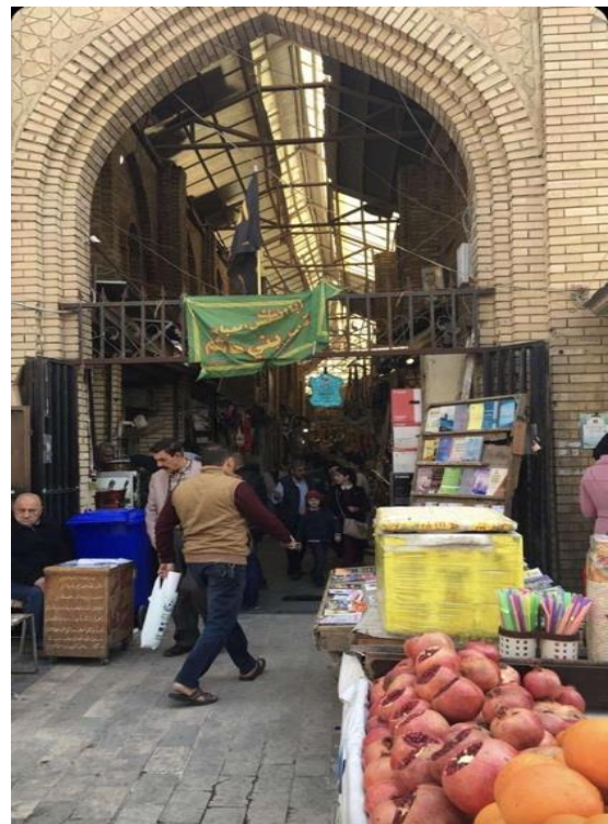
Figure 5. Suq Al-Sarai. Credit: Authors