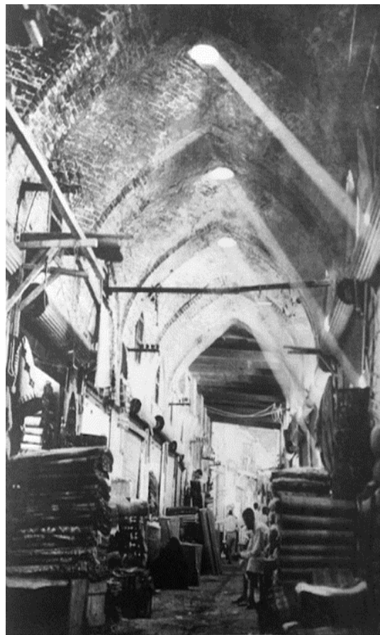
Figure 2. suq Al_Bazazeen in Baghdad.

and nineties trade concentrated in the centre of Baghdad and on its streets in some of its different neighbourhoods. Rent value rises and smaller architectural units' space were constructed on both sides of Al-Nahir Street (River Street). Traditional building materials were mostly used to build the shops [2]. Local bricks, plaster, and traditional roofing (vault and arched roofs) trimmings of bricks was used. New formation of streets appeared, some fields turned into trading stores and places where industries have benefited turned into business functions; the central locations of these trade places were affected and some of the shops had to migrate, especially with the migration of its trade and moved towards modern neighborhoods on the main streets of Baghdad [22].