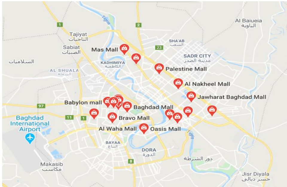
Figure 7. Map shows the spreading of malls in Baghdad city.

Al-Mansour Mall: Al-Mansour mall is a large-scale mall which was recently added in Al-Mansour district. The district is one of Baghdad's main city centres for shopping. The shopping mall is built beside many other malls in the same area and other districts in Baghdad. It is a commercial marketing complex added to the city's fabric in Al-Mutanabbi neighbourhood in the centre of Al-Mansour district. One of the largest new malls in the city, it opened in 2013 and drew shoppers from all the districts of the city and from other cities in Iraq. It has a variety of facilities. It consists of four