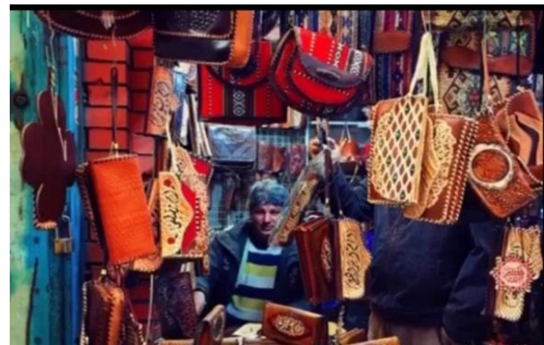
Figure 12. A traditional suq in Baghdad