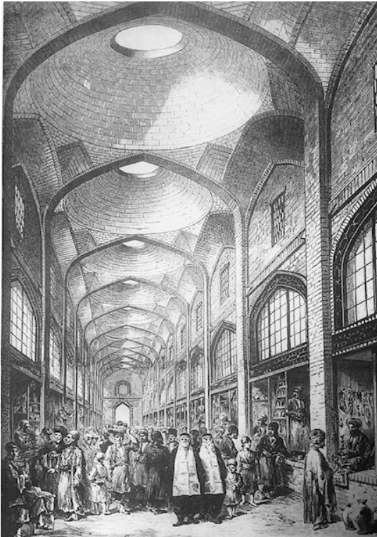
Figure 3. Painting of suq in Baghdad. Credit: Makeya 2005