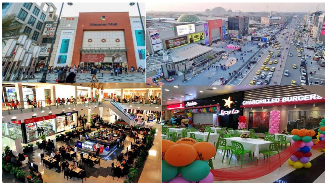
Figure 8. Mall Al-Mansour in Al-Mansour district in Baghdad.

levels over an area of 32,000 m 2 and has more than 170 shops. The site of the mall was originally planned for commercial use within the basic plan of the city. Located near the complex is a gas station 25 m away as well as many shops along the street, it is near industrial shops, laboratories, doctors' clinics and many other multi-offices uses. Architecturally the plan and design of this mall is a rectangular layout shape. The exterior and interior design is inspired by Western architecture style. The building consists of four levels.