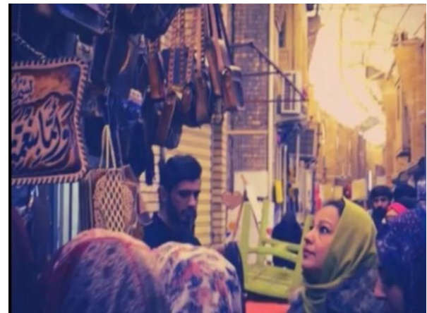
Figure 11. Traditional shop in Baghdad

suqs of Baghdad and, also, traditional suqs focus on single, local and low-quality goods. Figures 11 and 12 show a traditional suq in Baghdad selling handmade items.