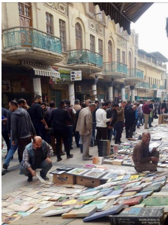
Figure 6. Al-Mutanabbi Street.

Typical local markets in modern developments are formed of a street in a certain size, lined with shops and connected to other small commercial streets where shops are spread through them. The phenomenon of closed commercial complexes (Malls) has emerged and grown during the last decade with the aim of stimulating the movement of the market and providing high quality service to the individual. The developments took place in different districts in the city of Baghdad, and what has helped was the improvement in security and relative economic development in recent years. The developments appeared in the form of vertical commercial complexes, some of which are complete, while others are in progress, leading to the purchase of several services in a specific place and is considered a closed place where most services are available. Where there is an emergence and speed of achieving these