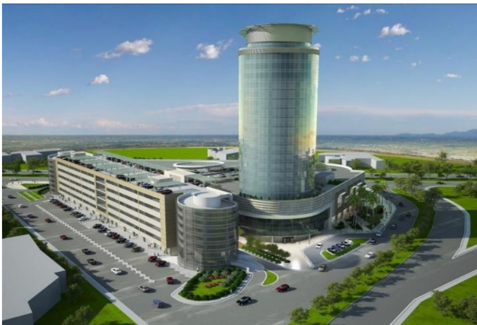
Figure 9. 3D digital drawing of Baghdad mall. Credit: gmp.uk.com

a huge complex consisting of three parts a shopping mall (Baghdad Mall), medical centre and a hotel, as shown in Figure 9. The design has given importance to its different parts to maximise opportunity growth and viabilities within the site context. The mall is a four-level building with a variety of facilities. It contains over 100 retail outlets, multiple restaurants, and cafeterias. It has open spaces; the corridors are long wide and provide places to sit and relax with a luxury atmosphere. It has a good visual relationship between inside and outside through large glass windows and also through a wide long courtyard with a small artificial water canal running in the middle and connected to a large fountain, as shown in Figure 10, with outdoor cafeterias connected to indoor activities as a resemblance to Al-Naher Street (one of the oldest streets in Baghdad) located along the banks of the River Tigris; this space attracts many visitors. Greenery and plantation with water features are added throughout the shopping complex. The mall has a 1000 car parking space. The architecture design is very contemporary and dynamic with an international style with concrete and glass material used in the design of the facades. This complex is a local development in a setting of competing attention and is considered a unique and contemporary architecture landmark in the capital city of Iraq [19].