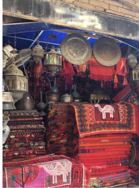
Figure 4. Suq Al-Safafer.

artists, poets, and academic figures in Baghdad. The gatherings take place every Friday [2]. This market street is specialized in selling books and is known for print works and art, as shown in Figure 6.